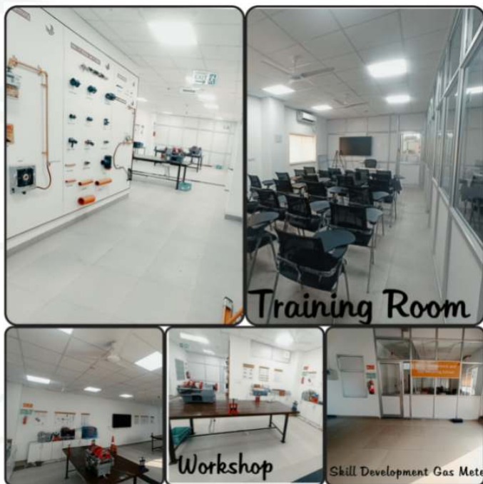
Pipe Fiter (O&G) Training Centre at Udaipur, Rajasthan by Secure Gas Meter (Training Partner)

In addition to Maharashtra, an association of Hydrocarbon with other State Skill Mission's are also underway for the training and skilling targets. Hence all the interested training partners / Companies / NGOs are hereby invited to become the training partner with Hydrocarbon. The link for application as a training partner with the Hydrocarbon Sector skill council is live at our website.